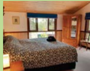
Queen Bedded Garden View Room.

AAA Rating ★★☆☆. All rates include full country breakfast. Private Lodge rate listed * is for 10 guests. Lodge has a wheelchair accessible ground floor guest room. Guests dogs are welcome to stay at the lodge in kennel provided.