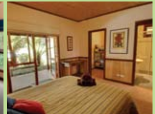
Ground Floor Family Suite.

Terms and Conditions. Rates are in Australian dollars inclusive of GST. Room rates are based on adult twin/double share. Rooms are not serviced daily. Weekends (Fri/Sat night) may require a two night minimum stay. Deposits are payable. Damaged or stolen lodge property must be paid for. Check-in is from 2pm. Check-out is at 10am. Cancellation within 7 days of date of arrival incurs a cancellation fee of one full nights accommodation per room cancelled. Cancellation within 72hrs of date of arrival incurs cancellation fee of 100% of total room nights cancelled. Check website for more information and special offers. Smoking is not allowed anywhere inside the lodge. Guests dogs are not permitted inside the lodge and must stay in kennel provided. Rates valid till 31/03/2011.